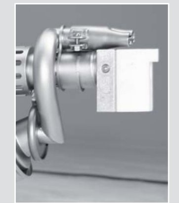
Easily adjustable air duct for all welding positions