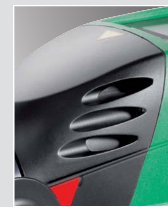
Quiet, powerful drive