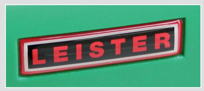
Leister stands for reliability and durability.

A screw specially designed for PVC was developed as the centrepiece of the new hand extruder. With this and the other countless technical advances, the WELDPLAST S2 PVC is a device which is convincing in every situation.