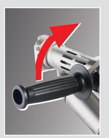
Continously variable pivoting handle