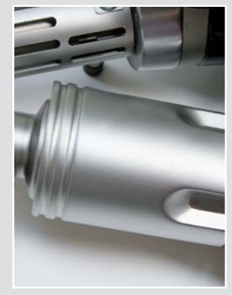
Hot air casing as heat protection