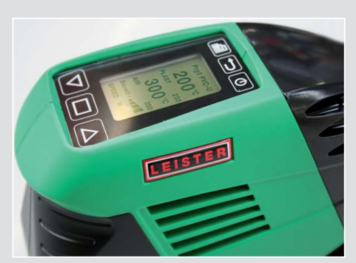
The perfect blend of functionality and design: the new WELDPLAST S2 PVC.