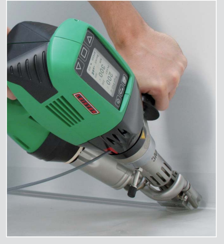
Despite its small size, the compact device produces up to 2.7kg of extrudate an hour.

Changes to the technical data remain reserved.