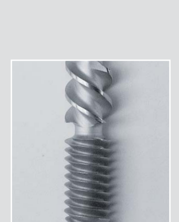
Extruder screw ideal for PVC