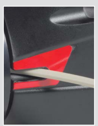
Double-sided, non-twisting wire feed