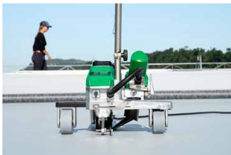
Ideal weight distribution