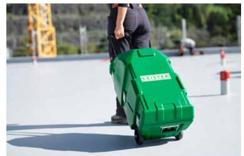
Sturdy rolling transport case