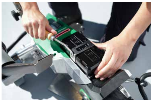
Increased welding pressure

The VARIMAT 700 automatic welding machine offers constant process reliability and tracking accuracy for flat roof welding. High contact pressure, innovative nozzle swivel-in mechanism, LQS and power management ensure welding quality.