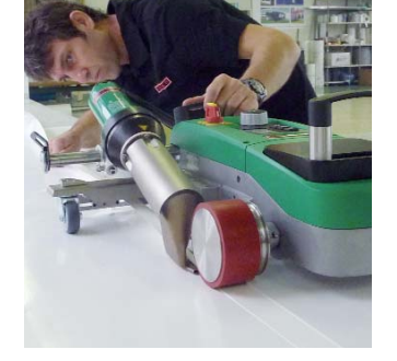
Very easy hem and piping welds with the hem- / piping welding kit