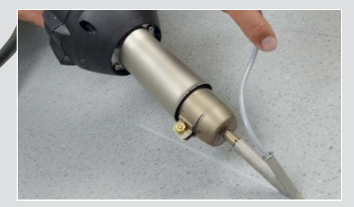
PVC and linoleum floor coverings