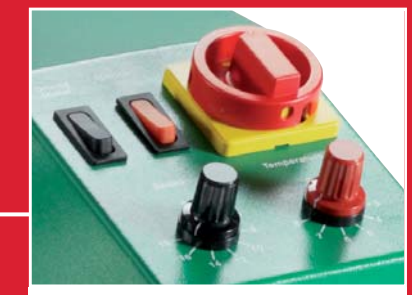
The well arranged operating unit offers simple control of the relevant welding parameters speed and temperature.