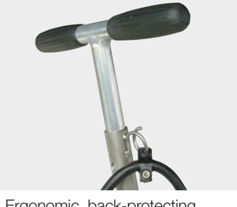
Ergonomic, back-protecting guide bar.

The power pack for fast and economic welding of tarpaulin bows for lorrys. With its top speed of up to 20 m/min it is the fastest tarpaulin bow welding machine in the world. The TAPEMAT «Spriegel», an investment, which already pays off after shortest time!