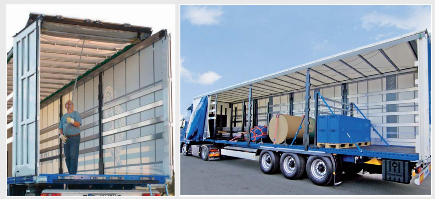
Tarpaulin bows for fixed and sliding rooftops of lorrys.