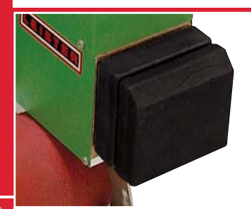
Extra weights for more pressure and a perfect welding quality.