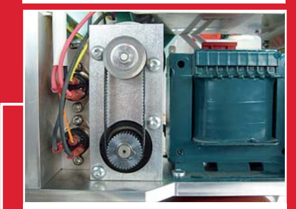
Powerful drive motor for top welding speeds.