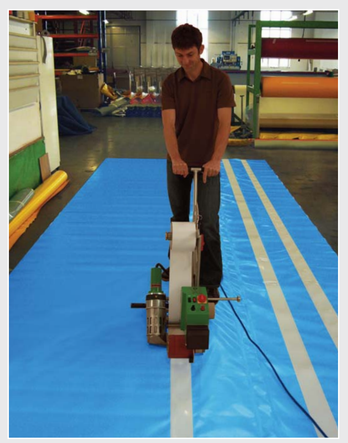
Intuitive operation and simple handling