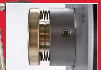
The tension brake disc ensures constant tension when rolling off the strap.