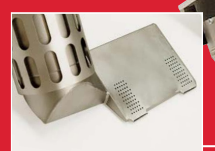
The sturdy hot air nozzle guarantees perfect welding quality.