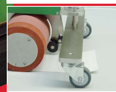
Accessory: Extraction device for changing to next welding seam easily.