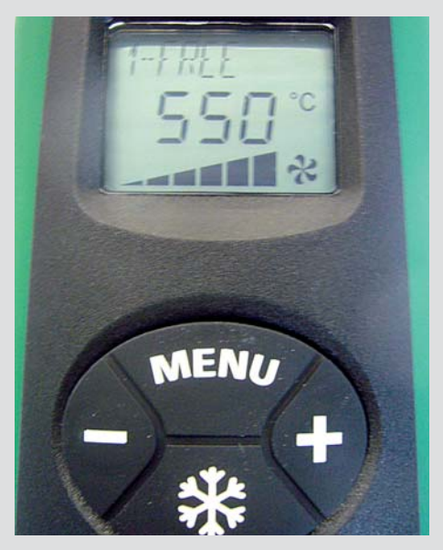
Electronics: Freely storable profiles with straightforward operation