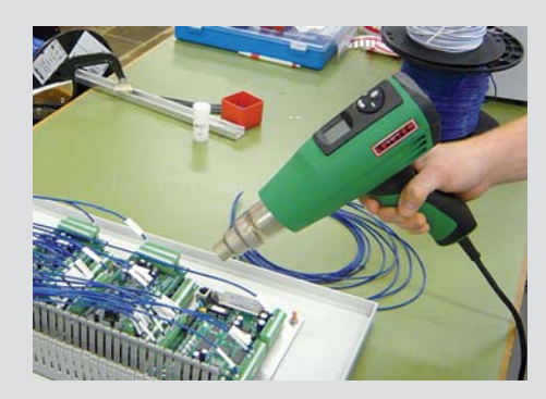
Ergonomics: Balanced design for strain-free work