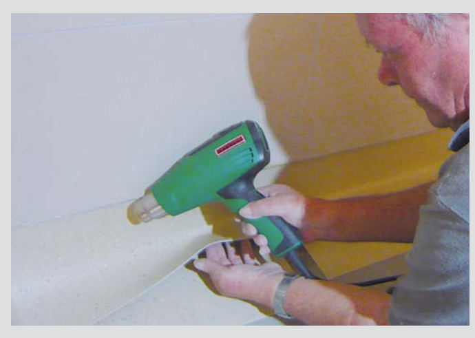
Rapid shaping of floor coverings