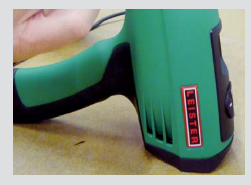
Durability: The soft-grip surface and design enable very good standing at continuous operation