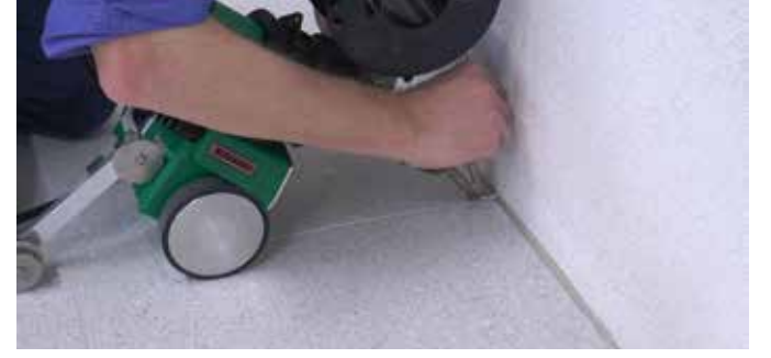
Professional, inexpensive, incredibly versatile: The new MINIFLOOR (TRIAC plus drive unit) for smart professionals.

The MINIFLOOR is ideal for short joints and small projects.