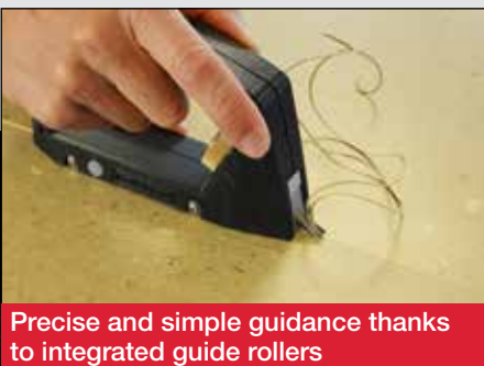
Precise and simple guidance thanks to integrated guide rollers