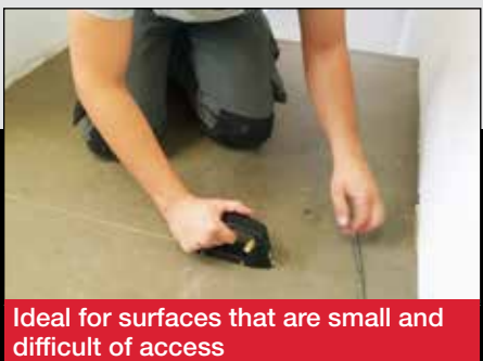
Ideal for surfaces that are small and difficult of access

Headquarters: Leister Technologies AG 6056 Kägiswil / Switzerland leister@leister.com