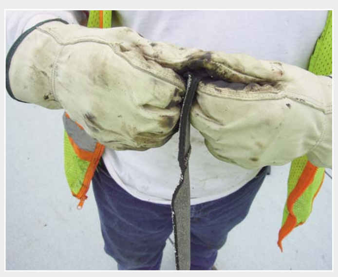
The peel test demonstrates that the weld seam strength is significantly better with the BITUMAT B2 than with a naked flame.

The BITUMAT B2 is designed with an integrated air dam rotating rubber belt located between the drive and pressure roller — ensuring that the bitumen sheet is pressed downward during the welding process, while the controlled hot air volume is routed between the bitumen sheets. The use of this feature results in consistent, uniform weld seams. Furthermore, the air dam better focuses and traps the air precisely where it is needed, preventing the burning of the underlying thermal insulation. In controlled peel tests, the BITUMAT B2 achieved more consistent results when compared with welds achieved with a torch. The heightadjustable handle of the BITUMAT B2 makes maneuvering the machine during the welding process simple. Besides the adjustable parameters for speed, temperature and air volume, weight can also be adapted to the conditions of the material by attaching additional weight.