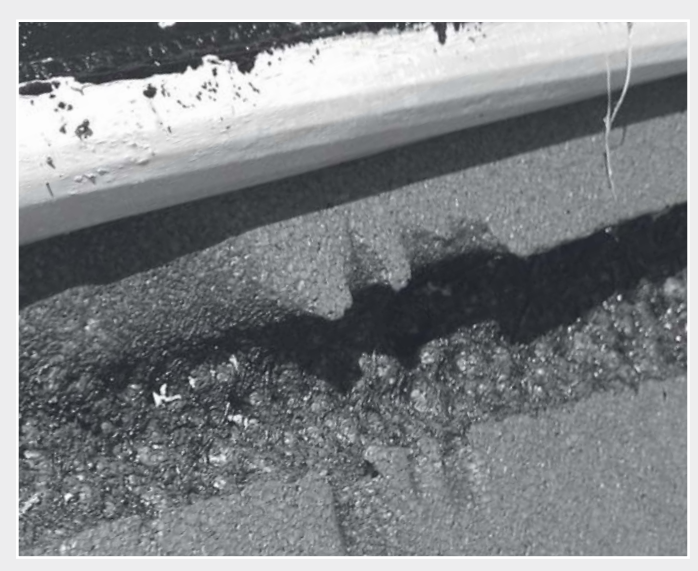
Damage to the thermal insulation with open flame can be avoided with BITUMAT B2.