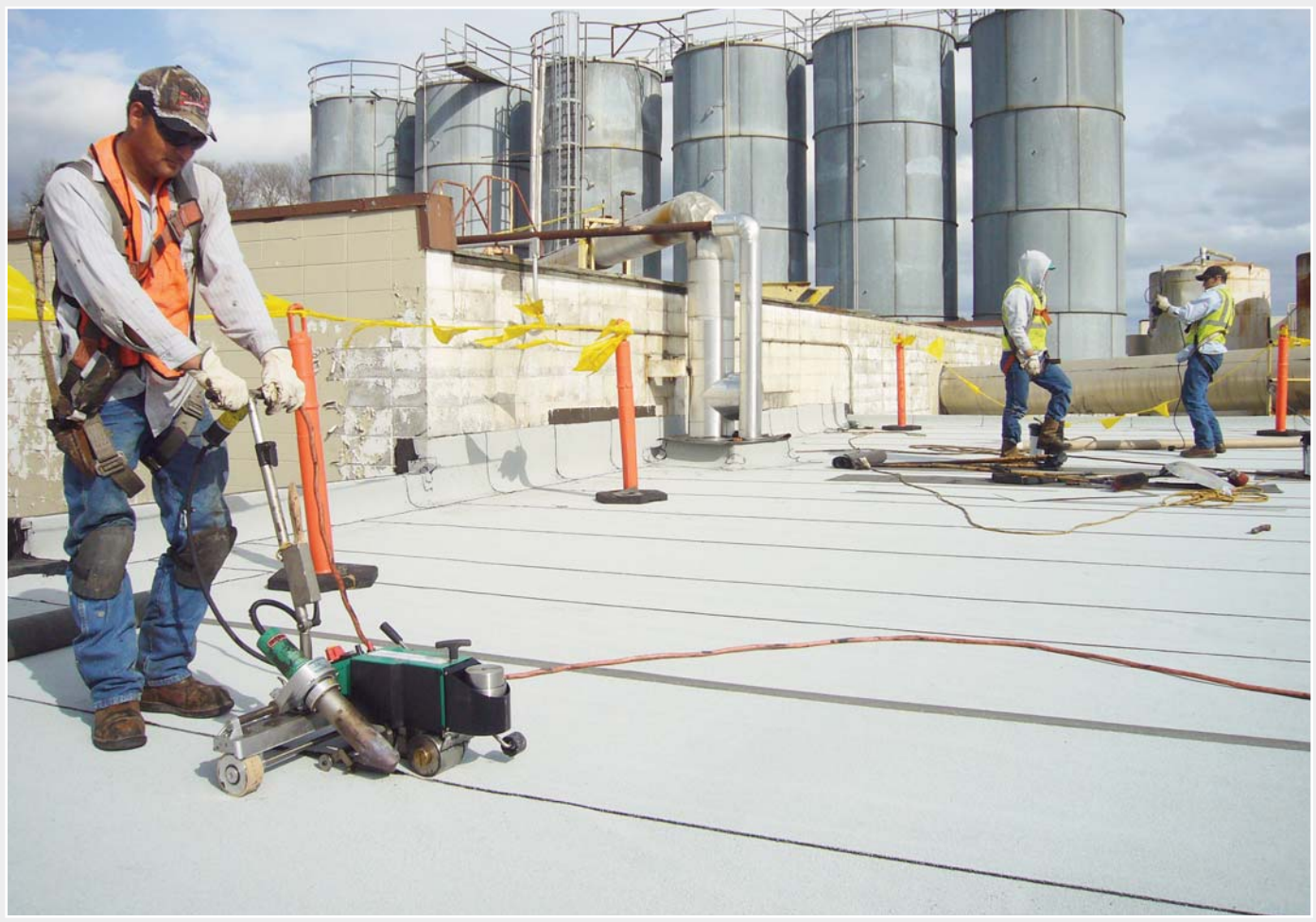
Safe and secure welding of bitumen sheeting with the BITUMAT B2.

Tyson Foods, with headquarters in Springdale, Ark., is one of the world's largest processors and marketers of chicken, beef and pork, as well as prepared foods. The roof of Tyson Foods' Noel, Mo., production facility, had become quite old and was replaced. Approximately 1,968 square feet (600 meters) had to be newly sealed as quickly and neatly as possible. When it came to the sealing material for the massive roof area the decision makers opted to use bitumen, but only under the condition that open flame would NOT be utilized during the roofing work. This specification did not pose a problem for Harness Roofing. They knew Leister had a welding tool in its range that welds bitumen sheeting with hot air instead of an open flame, the BITUMAT B2.