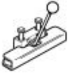
Trolley attachment for UNIFLOOR E/S