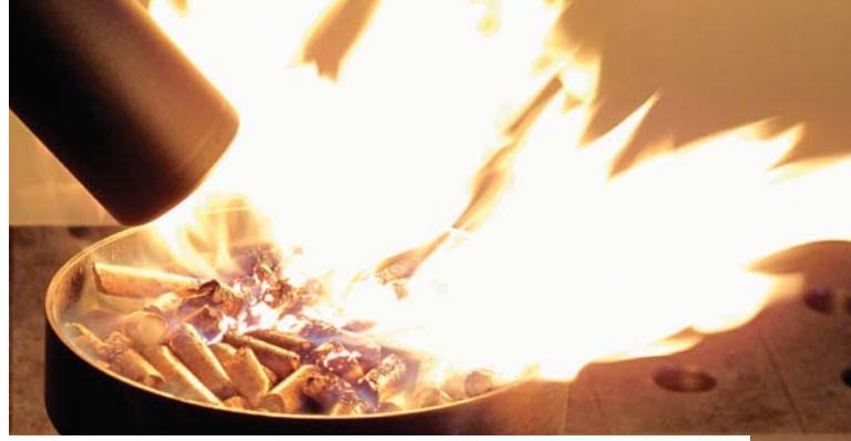
Clean ignition process due to optimum heat level.

the housing, the freely configurable plug connector and the air hose connection adapter with one-inch inner thread are innovative measures ensuring optimum installation into heating boilers of all categories.